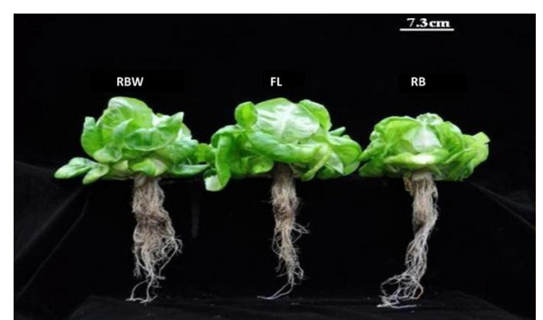
Fig. 4. Growth of lettuce plants under different light qualities for 35 days after sowing. Bar indicates 7.3 cm.

Shape, color, crispness, and sweetness are the four major marketableproperties of lettuce. To show trends in the evaluation of attributes by the panelists, results for mouthfeel and visual characteristics were depicted for each treatment as spider-webgraphics. Plants under RBW treatment hadhigh grades of 5-5.5 for all parameters. FL-treated plants (4.5) had a lower level for crispness than RBW-treated plants (5.5). The ranges of shape, crispness, and sweetness observed in RB plants were 2- (Fig. 5). The larger the rhombus was, the higher edible quality itrepresented. All of the sensory characteristics from RBW- and FLtreated plants had above-average scores. Nevertheless, the shape, crispness, and sweetness of RB-treated plants were not acceptable for the market.