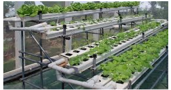
Fig. 1: Hydroponics

Drip Irrigation : It is a type of micro-irrigation system that allows water to drip slowly to the roots of plants, either from above the soil surface or buried below the surface. The goal is to place water directly into the root zone.