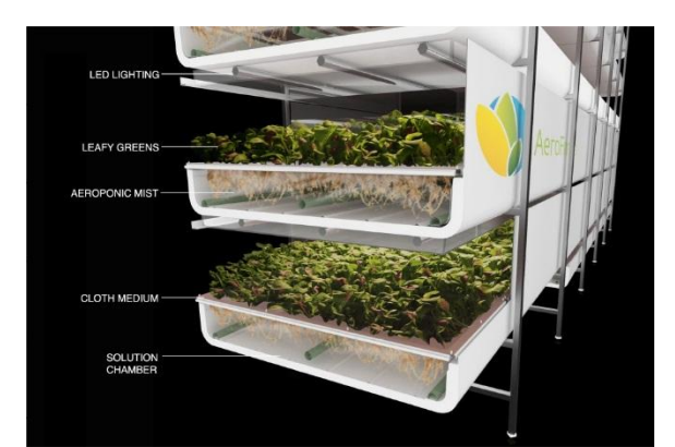
Fig. 2: Aeroponics